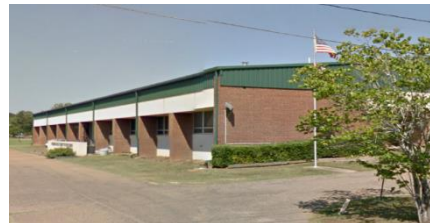
Career Technical Center