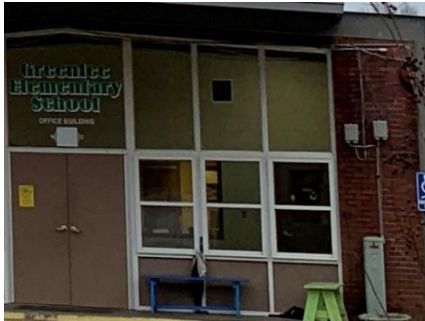
Greenlee Elementary Pre-Kindergarten – 6th Grade