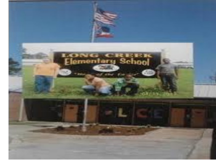
Long Creek Elementary Pre-Kindergarten - 6th Grade